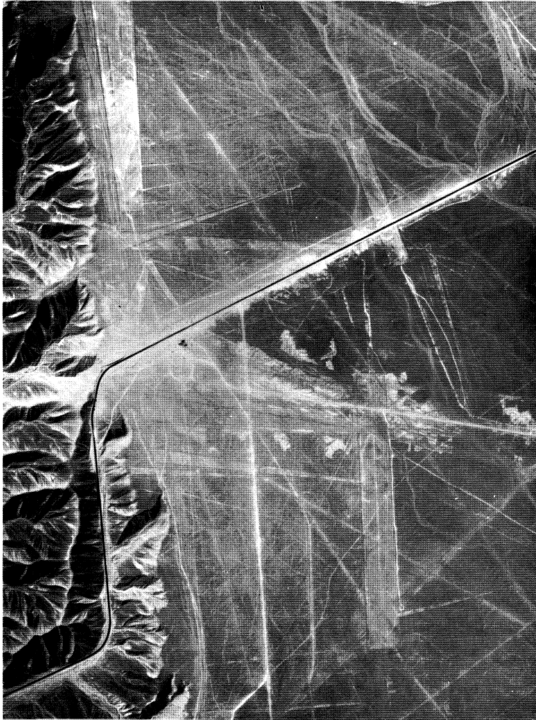
FIGURE 2. Ancient markings in the desert near the Ingenio valley, Peru. The large rectangle is approximately 800 m in length. The oblique, dark line is the Panamerican Highway.