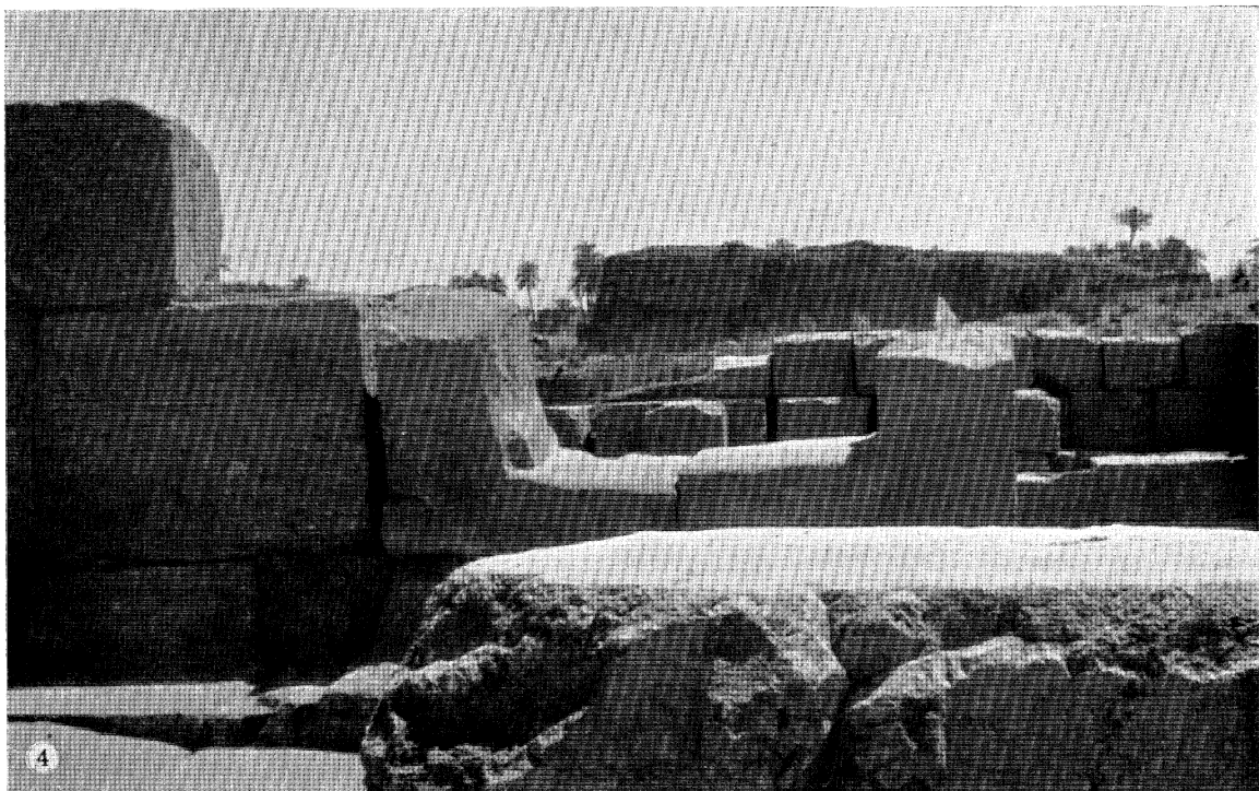
FIGURE 3. Position of the exterior stairway leading to the High Room of the Sun on the roof of the Hall of Festivals, in the Great Temple of Amon-Re.